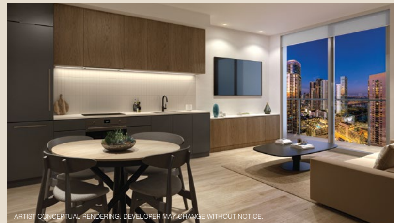
ARTIST CONCEPTUAL RENDERING. DEVELOPER MAY CHANGE WITHOUT NOTICE.

INTERIOR DESIGNERS DESIGN AGENCY thedesignagencyca.com