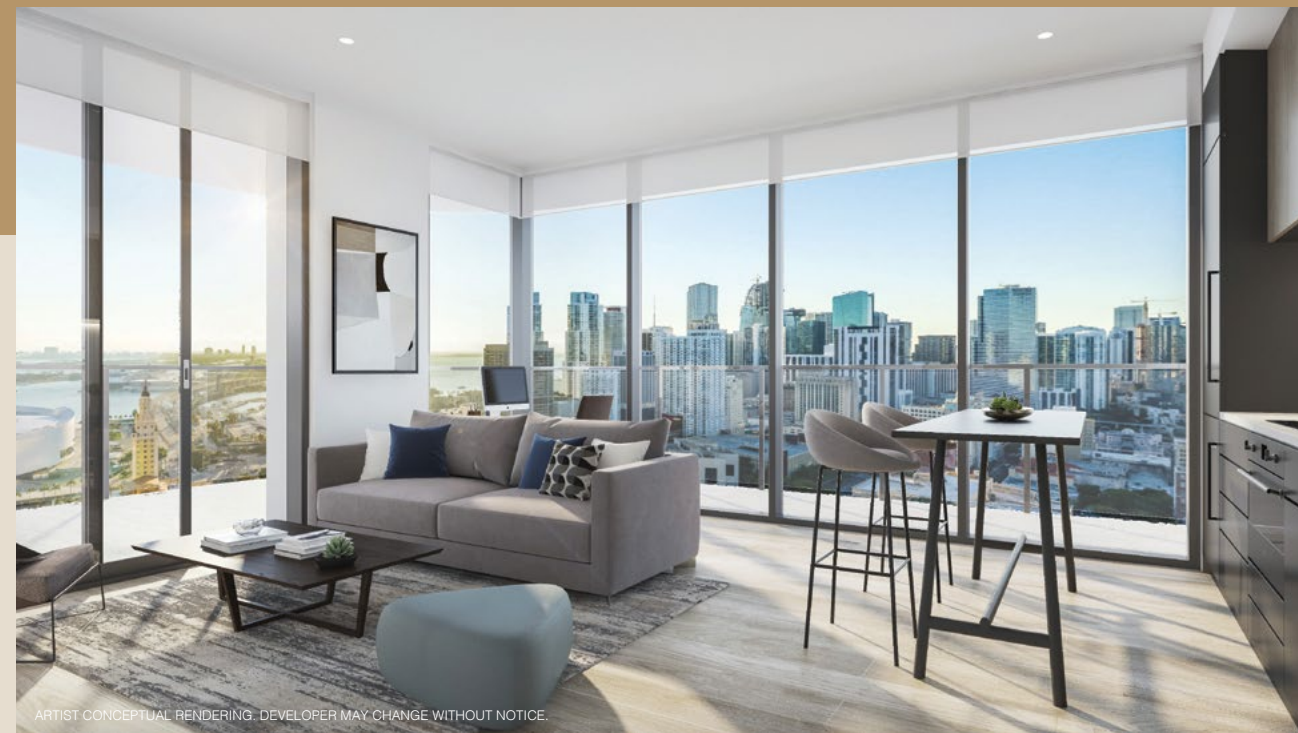
ARTIST CONCEPTUAL RENDERING. DEVELOPER MAY CHANGE WITHOUT NOTICE.

THE WORLD'S MOST VIBRANT CITY YOUR NEW ADDRESS